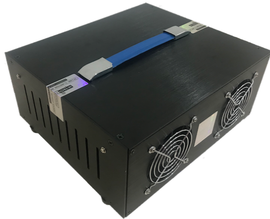
Hitech Terminal Pro 70 Features